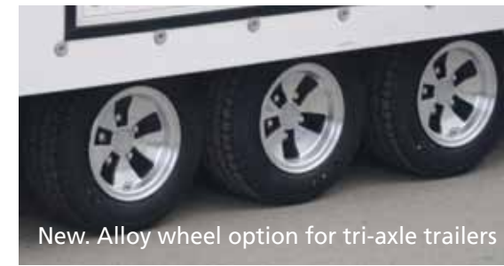
New. Alloy wheel option for tri-axle trailers